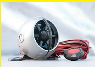
Deluxe model # 27510 includes a dashmount switch with on/off indicator

27509 - Deer Alert in bilingual (English/French) clamshell package