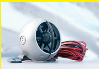
Model # 27509