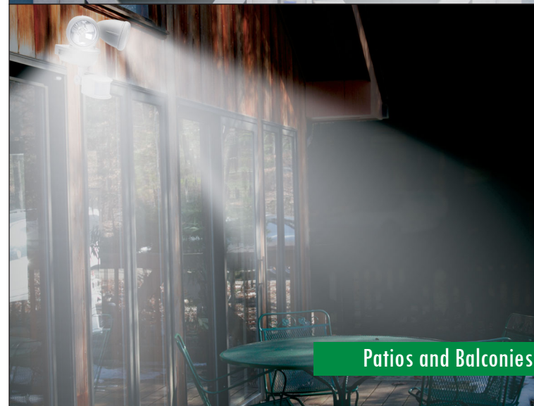
Patio and Balconies