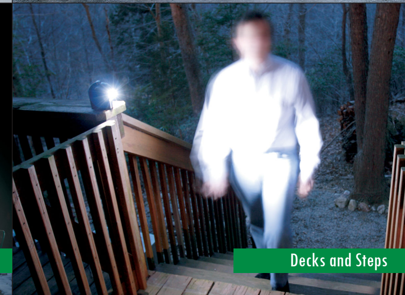
Decks and Steps